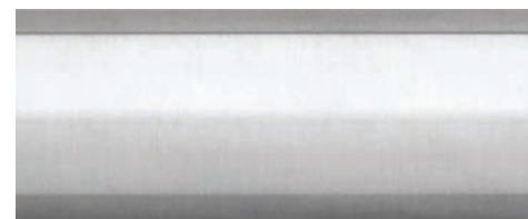
Chrome ML100-CH 1"D Pole