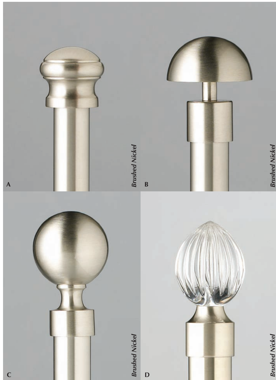
Finial lengths shown in parentheses describe extension of finial beyond pole length. Solid Geometry finials fit Modern Hardware shown on page 40.

A SG130-1 1 5/8" L (1/2" L) x 1 3/4" W Use with 1" D Pole Available in Gunmetal, Brushed Nickel or Black