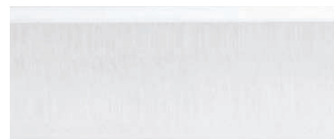
Acrylic AC-138 1 3/8"D Pole