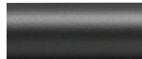
Gunmetal ML100-GM 1"D Pole ML138-GM 1 3/8"D Pole