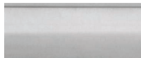
Brushed Nickel ML100-BN 1"D Pole ML138-BN 1 3/8"D Pole