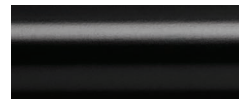
Black ML100-B 1"D Pole ML138-B 1 3/8"D Pole